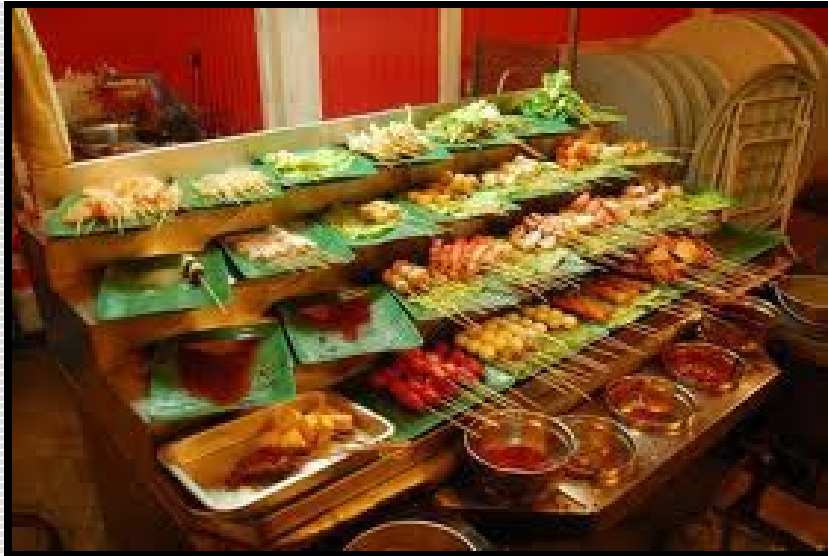
Famous foods of Penang